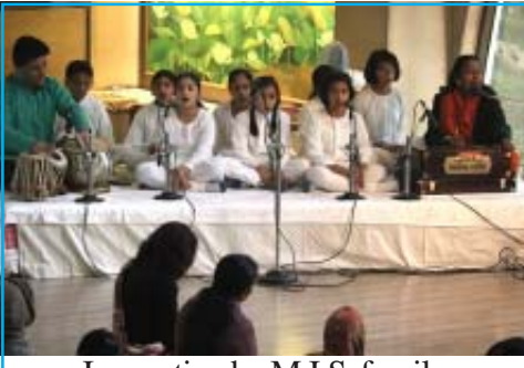
Invocation by M.I.S. family

and medical spaces with their aspirations and endeavours guided by a higher and wider vision.