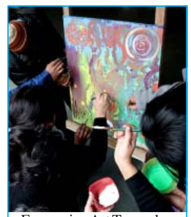
Expressive Art Towards a New Creation II